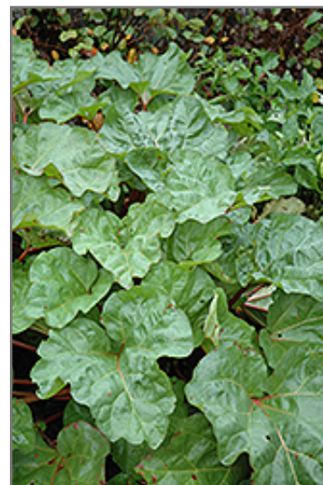
Valentine Rhubarb foliage

This is an herbaceous perennial with a rigidly upright and towering form. Its wonderfully bold, coarse texture can be very effective in a balanced garden composition. This plant will require occasional maintenance and upkeep, and can be pruned at anytime. Deer don't particularly care for this plant and will usually leave it alone in favor of tastier treats. It has no significant negative characteristics.