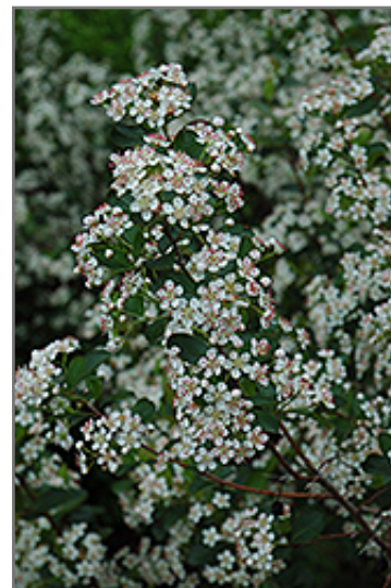
Black Chokeberry flowers