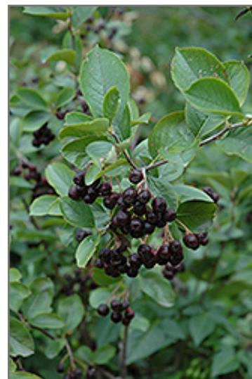
Black Chokeberry fruit