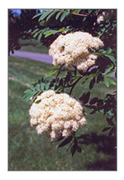
European Mountain Ash flowers

This tree should only be grown in full sunlight. It is very adaptable to both dry and moist locations, and should do just fine under average home landscape conditions. It is not particular as to soil type or pH. It is highly tolerant of urban pollution and will even thrive in inner city environments. This species is not originally from North America.