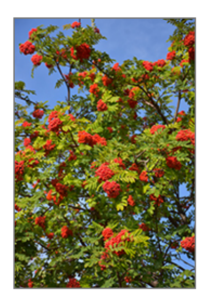
European Mountain Ash fruit