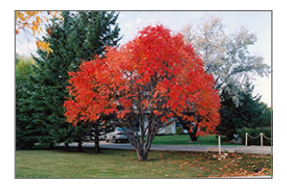
European Mountain Ash in fall

European Mountain Ash is recommended for the following landscape applications;