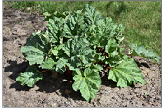
Chipman Red Rhubarb

Chipman Red Rhubarb features bold spikes of white flowers rising above the foliage from early to mid summer. Its enormous crinkled round leaves remain green in colour throughout the season. The red stems are very colorful and add to the overall interest of the plant.