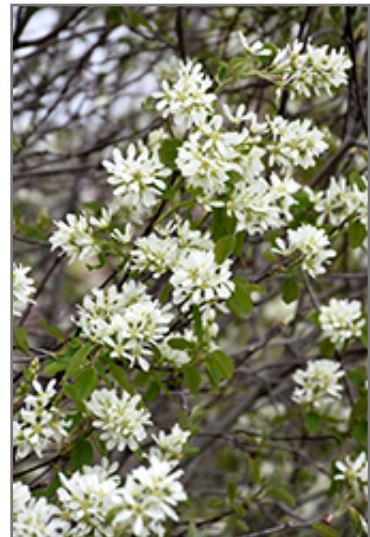
Martin Saskatoon flowers