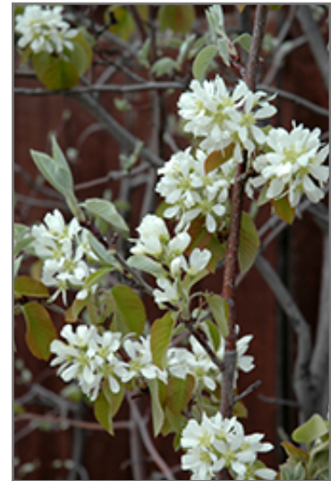
Martin Saskatoon flowers

Martin Saskatoon is covered in stunning clusters of white flowers rising above the foliage from early to mid spring before the leaves. It has dark green deciduous foliage. The oval leaves turn an outstanding yellow in the fall. It features an abundance of magnificent blue berries with powder blue overtones in late spring.