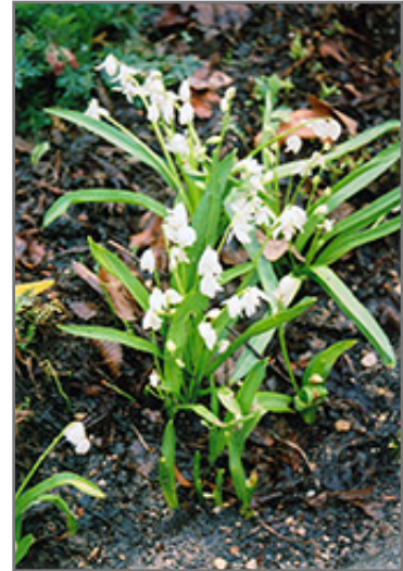
White Spring Squills in bloom

White Spring Squills will grow to be only 4 inches tall at maturity extending to 6 inches tall with the flowers, with a spread of 4 inches. It grows at a fast rate, and under ideal conditions can be expected to live for approximately 5 years. As an herbaceous perennial, this plant will usually die back to the crown each winter, and will regrow from the base each spring. Be careful not to disturb the crown in late winter when it may not be readily seen! As this plant tends to go dormant in summer, it is best interplanted with late-season bloomers to hide the dying foliage.