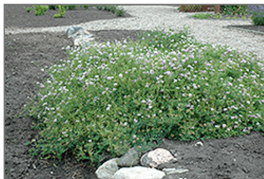
Crown Vetch in bloom