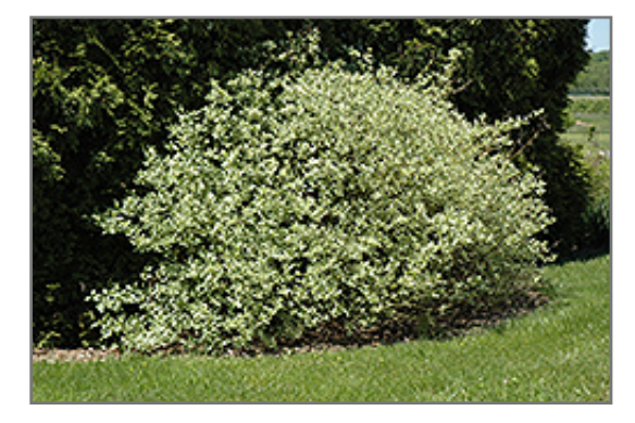
Silver and Gold Dogwood