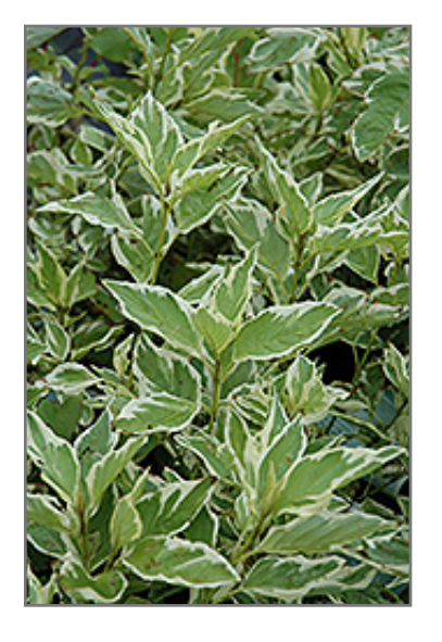
Silver and Gold Dogwood foliage