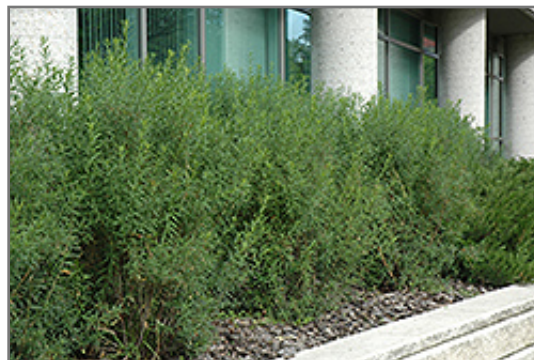
Dwarf Turkistan Burning Bush