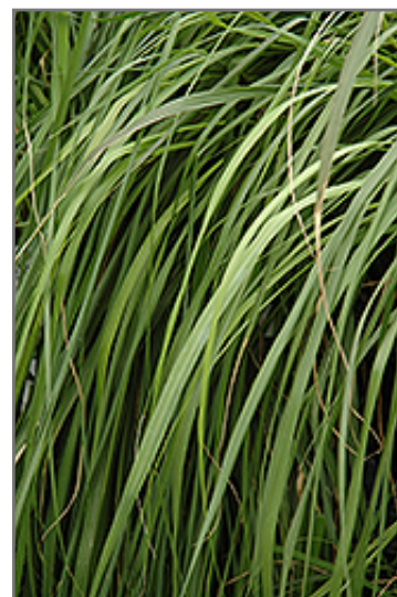
Red Bunny Tails Fountain Grass foliage