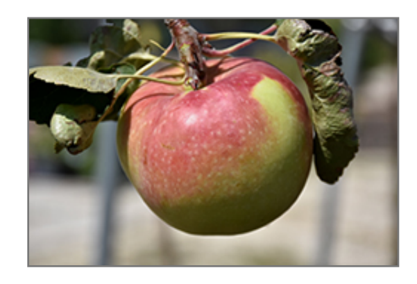
Fall Red Apple fruit

Fall Red Apple features showy clusters of lightly-scented white flowers with shell pink overtones along the branches in mid spring, which emerge from distinctive pink flower buds. It has forest green deciduous foliage. The pointy leaves turn yellow in fall. The fruits are showy ruby-red apples carried in abundance in early fall. The fruit can be messy if allowed to drop on the lawn or walkways, and may require occasional clean-up.