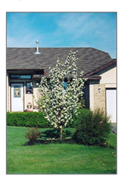
Fall Red Apple in bloom