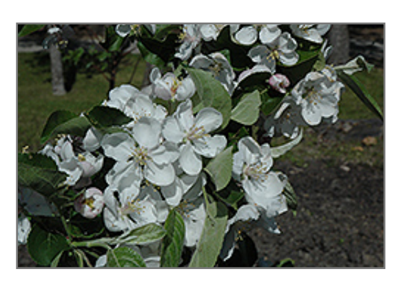
Fall Red Apple flowers

This tree is typically grown in a designated area of the yard because of its mature size and spread. It should only be grown in full sunlight. It prefers to grow in average to moist conditions, and shouldn't be allowed to dry out. It is not particular as to soil type or pH. It is highly tolerant of urban pollution and will even thrive in inner city environments. This particular variety is an interspecific hybrid.