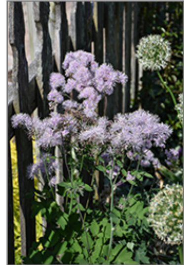
Meadow Rue flowers

Meadow Rue is recommended for the following landscape applications;