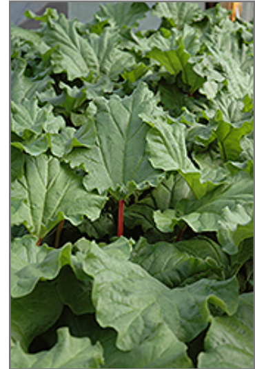
Canada Red Rhubarb

This is an herbaceous perennial with a rigidly upright and towering form. Its wonderfully bold, coarse texture can be very effective in a balanced garden composition. This plant will require occasional maintenance and upkeep, and can be pruned at anytime. Deer don't particularly care for this plant and will usually leave it alone in favor of tastier treats. It has no significant negative characteristics.