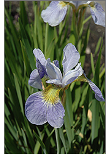
Sky Wings Siberian Iris flowers