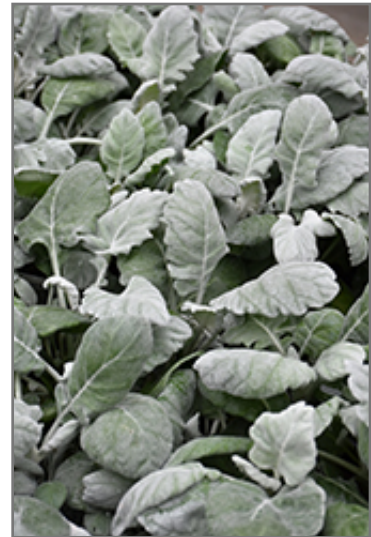
New Look Dusty Miller foliage