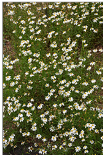
White Alpine Tickseed flowers