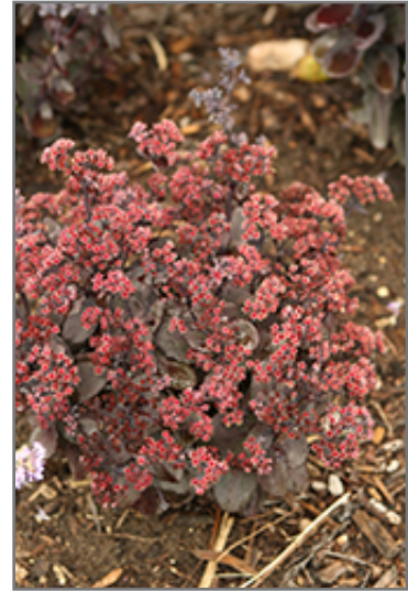
Rock 'N Grow Back in Black Stonecrop flowers

At Dutch Growers, we treat this plant as a "HOBBY PLANT". It is not officially recognized as winter-hardy in our zone 3, however, there is a strong likelihood that it will survive winter. Warranty expires on Nov. 1 season of purchase.