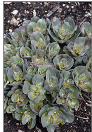
Rock 'N Grow Back in Black Stonecrop foliage