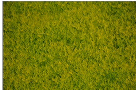
Scotch Moss foliage