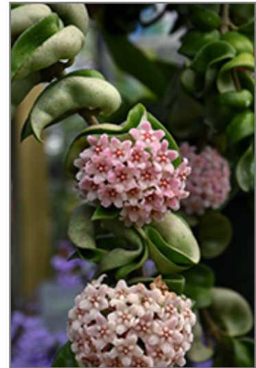
Hindu Rope Plant flowers

This is an herbaceous houseplant with a spreading, ground-hugging habit of growth. This plant usually looks its best without pruning, although it will tolerate pruning.