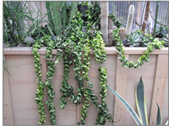
Hindu Rope Plant

When grown indoors, Hindu Rope Plant can be expected to grow to be about 12 inches tall at maturity, with a spread of 3 feet. It grows at a medium rate, and under ideal conditions can be expected to live for approximately 10 years. This houseplant should be situated in a location that gets indirect sunlight at most, although it will usually require a more brightly-lit environment than what artificial indoor lighting alone can provide. It is very adaptable to both dry and moist soil, but will not tolerate any standing water. The surface of the soil shouldn't be allowed to dry out completely, and so you should expect to water this plant once and possibly even twice each week. Be aware that your particular watering schedule may vary depending on its location in the room, the pot size, plant size and other conditions; if in doubt, ask one of our experts in the store for advice. It is particular about its soil conditions, with a strong preference for rich, acidic soil. Contact the store for specific recommendations on pre-mixed potting soil for this plant.