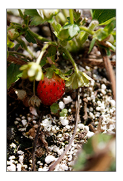
Berried Treasure White Strawberry fruit