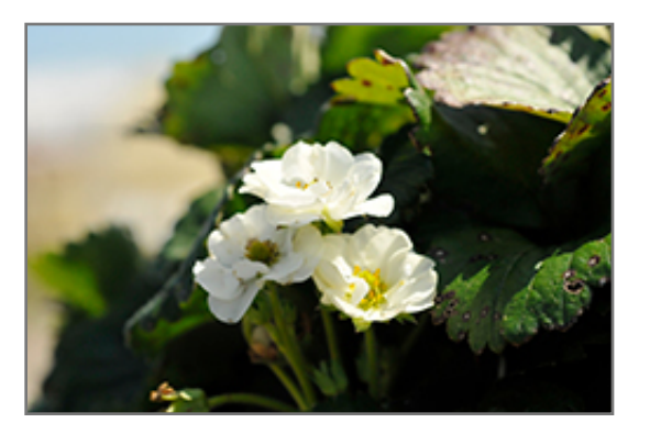
Berried Treasure White Strawberry flowers