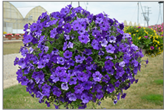
Headliner Night Sky Petunia in bloom

Headliner Night Sky Petunia will grow to be about 16 inches tall at maturity, with a spread of 30 inches. When grown in masses or used as a bedding plant, individual plants should be spaced approximately 24 inches apart. Its foliage tends to remain dense right to the ground, not requiring facer plants in front. This fast-growing annual will normally live for one full growing season, needing replacement the following year.