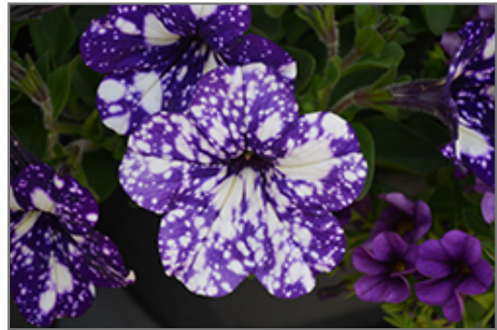
Headliner Night Sky Petunia flowers

Headliner Night Sky Petunia is recommended for the following landscape applications;