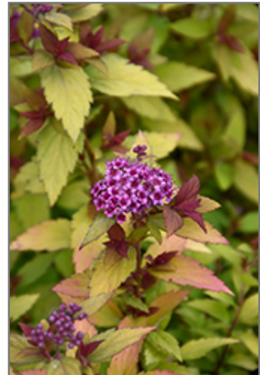
Poprocks Rainbow Fizz Spirea flowers