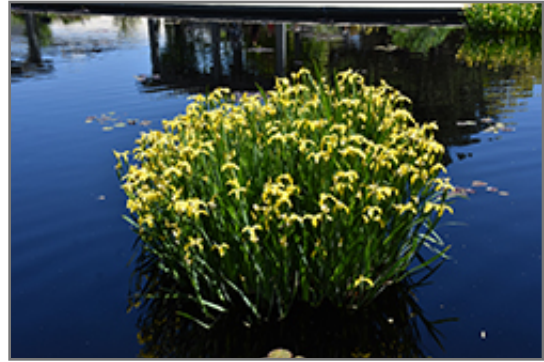
Yellow Flag Iris in bloom