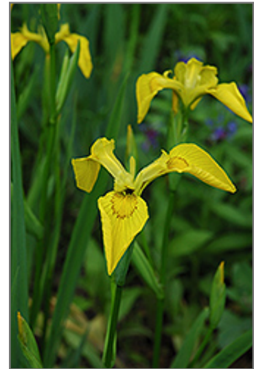
Yellow Flag Iris flowers