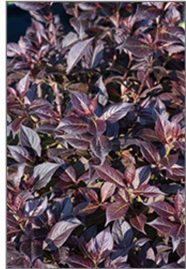
Date Night Stunner Weigela foliage