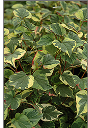
Variegated Chameleon Plant foliage