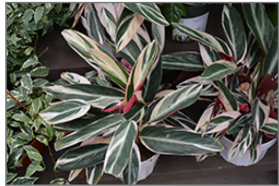
Triostar Stromanthe in full