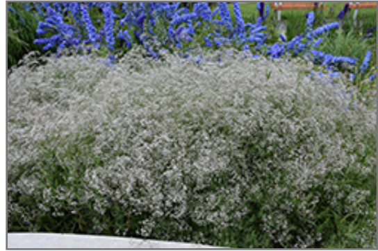
Common Baby's Breath in bloom