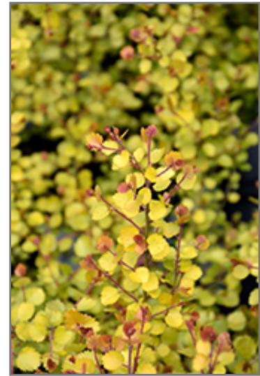
Cesky Gold Dwarf Birch foliage