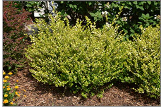
Cesky Gold Dwarf Birch