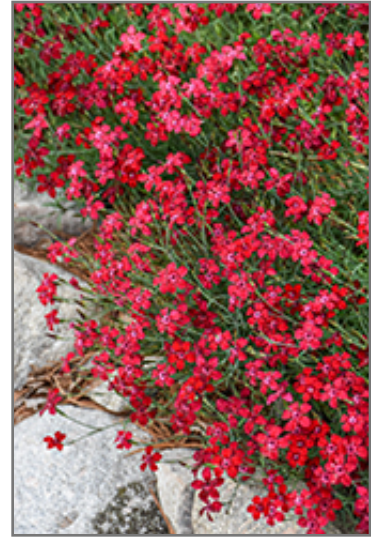
Flashing Light Maiden Pinks flowers

Flashing Light Maiden Pinks is recommended for the following landscape applications;