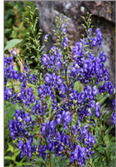
Common Monkshood flowers

This plant will require occasional maintenance and upkeep, and is best cleaned up in early spring before it resumes active growth for the season. It is a good choice for attracting bees, butterflies and hummingbirds to your yard, but is not particularly attractive to deer who tend to leave it alone in favor of tastier treats. It has no significant negative characteristics.