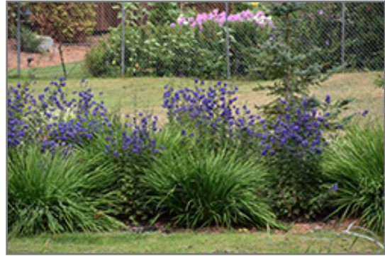
Common Monkshood in bloom

Common Monkshood will grow to be about 3 feet tall at maturity extending to 4 feet tall with the flowers, with a spread of 24 inches. It tends to be leggy, with a typical clearance of 1 foot from the ground, and should be underplanted with lower-growing perennials. The flower stalks can be weak and so it may require staking in exposed sites or excessively rich soils. It grows at a medium rate, and under ideal conditions can be expected to live for approximately 15 years. As an herbaceous perennial, this plant will usually die back to the crown each winter, and will regrow from the base each spring. Be careful not to disturb the crown in late winter when it may not be readily seen!