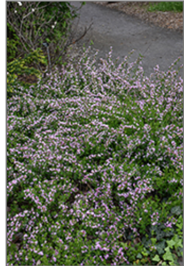
Purple Broom in bloom

At Dutch Growers, we treat this plant as a "HOBBY PLANT". It is not officially recognized as winter-hardy in our zone 3, however, there is a strong likelihood that it will survive winter. Warranty expires on Nov. 1 season of purchase.