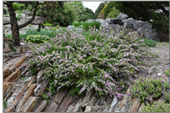
Purple Broom in bloom