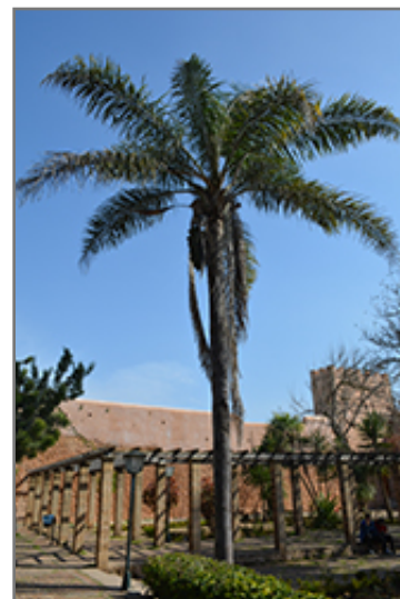
Queen Palm

Queen Palm is recommended for the following landscape applications;