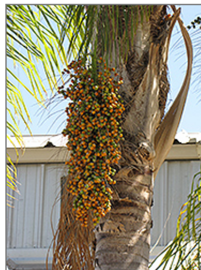
Queen Palm fruit