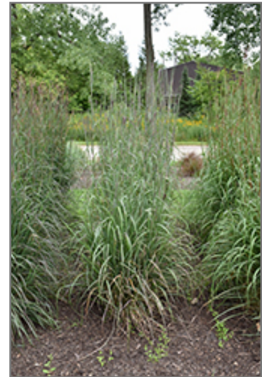
Indian Warrior Bluestem in bloom