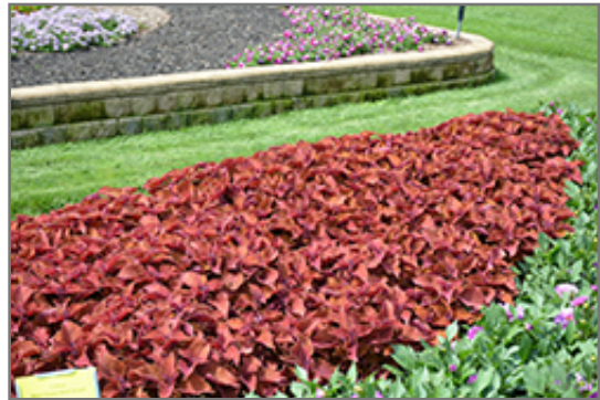
Wall Street Coleus