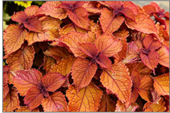
Wall Street Coleus foliage