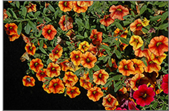
Superbells Spicy Calibrachoa flowers

Superbells Spicy Calibrachoa is recommended for the following landscape applications;