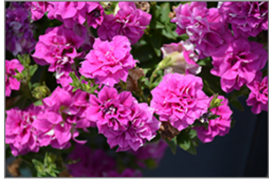
Surfinia Summer Double Rose Petunia flowers