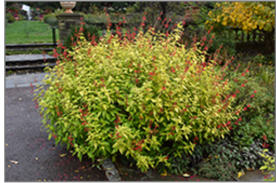
Golden Delicious Pineapple Sage in bloom

Golden Delicious Pineapple Sage is recommended for the following landscape applications;