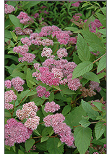
Froebelii Spirea flowers

This shrub will require occasional maintenance and upkeep, and is best pruned in late winter once the threat of extreme cold has passed. It is a good choice for attracting butterflies to your yard, but is not particularly attractive to deer who tend to leave it alone in favor of tastier treats. It has no significant negative characteristics.