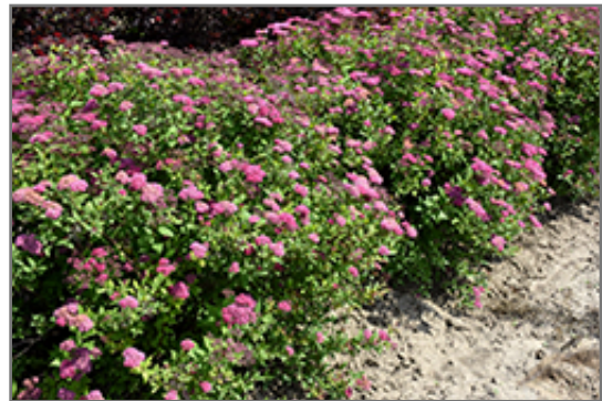
Froebelii Spirea in bloom