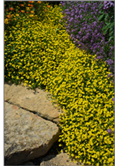
Gold Dust Mecardonia in bloom

Gold Dust Mecardonia is recommended for the following landscape applications;