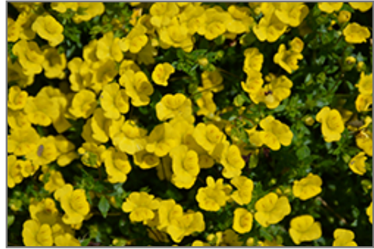
Gold Dust Mecardonia flowers

Gold Dust Mecardonia will grow to be only 4 inches tall at maturity, with a spread of 15 inches. When grown in masses or used as a bedding plant, individual plants should be spaced approximately 12 inches apart. Its foliage tends to remain low and dense right to the ground. Although it's not a true annual, this fast-growing plant can be expected to behave as an annual in our climate if left outdoors over the winter, usually needing replacement the following year. As such, gardeners should take into consideration that it will perform differently than it would in its native habitat.