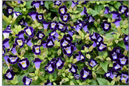
Catalina Midnight Blue Torenia flowers

This plant will require occasional maintenance and upkeep, and should not require much pruning, except when necessary, such as to remove dieback. It is a good choice for attracting bees and hummingbirds to your yard, but is not particularly attractive to deer who tend to leave it alone in favor of tastier treats. It has no significant negative characteristics.