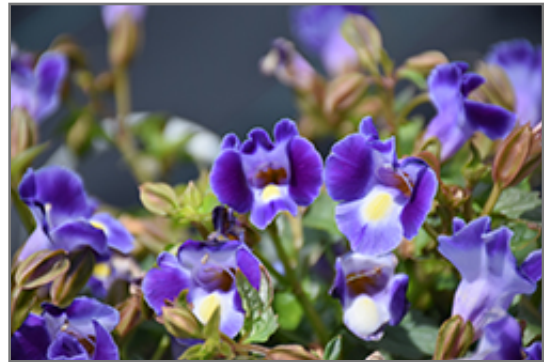
Catalina Midnight Blue Torenia flowers