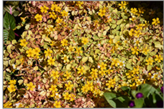
Molten Lava Shamrock in bloom