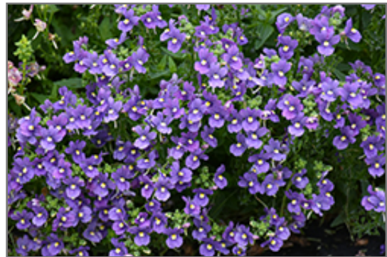
Bluebird Nemesia flowers