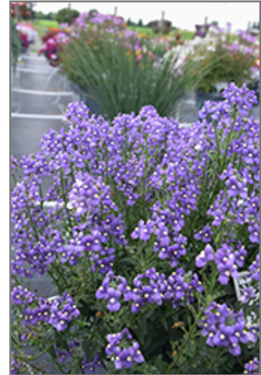
Bluebird Nemesia flowers