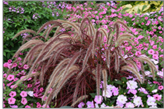
Fireworks Fountain Grass

Fireworks Fountain Grass is recommended for the following landscape applications;