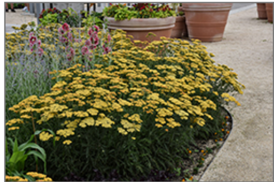
Terra Cotta Yarrow in bloom