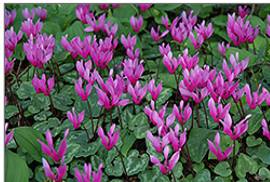
Purple Cyclamen in bloom