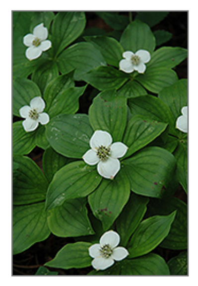
Bunchberry flowers