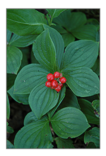
Bunchberry fruit