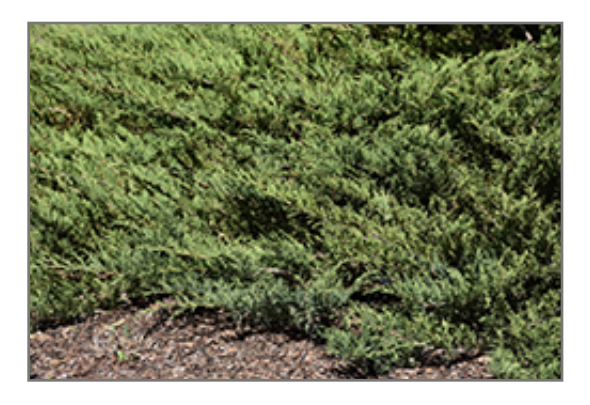
Blue Danube Juniper