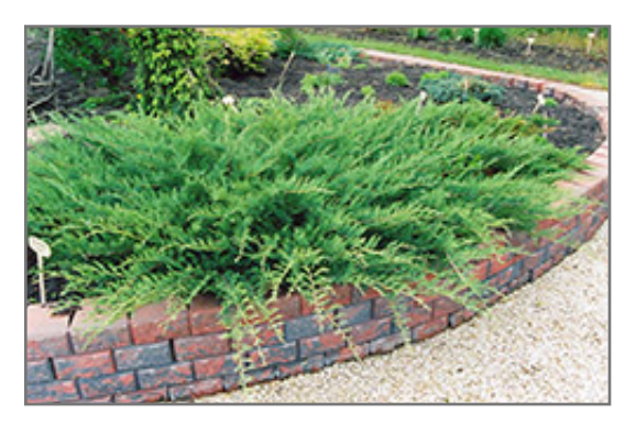
Blue Danube Juniper