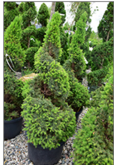
Dwarf Alberta Spruce (topiary form)