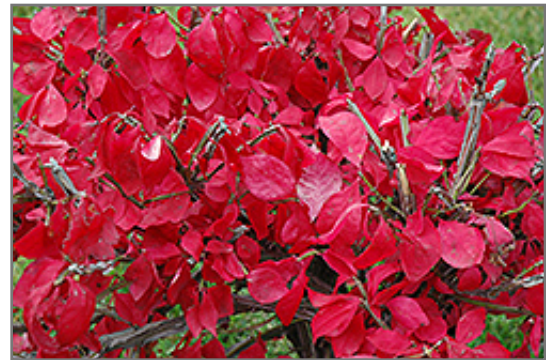
Compact Winged Burning Bush in fall