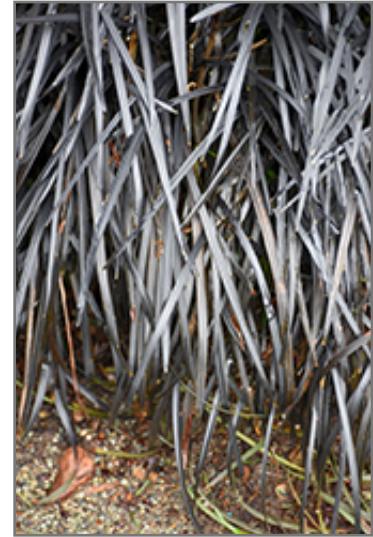
Black Mondo Grass foliage

At Dutch Growers, we treat this plant as a "HOBBY PLANT". It is not officially recognized as winter-hardy in our zone 3, however, there is a strong liklihood that it will survive winter. Warranty expires on Nov. 1 season of purchase.